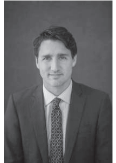
The Rt. Hon. Justin P. J. Trudeau, P.C., M.P. Prime Minister of Canada