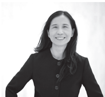
Dr. Theresa Tam

Dr. Theresa Tam was named Canada's Chief Public Health Officer in 2017. She is a paediatric infectious disease specialist with expertise in immunization, emergency preparedness, and global health security.