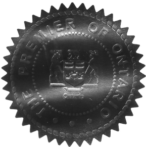
Doug Ford Premier

Legislative Building, Toronto October 22, 2022